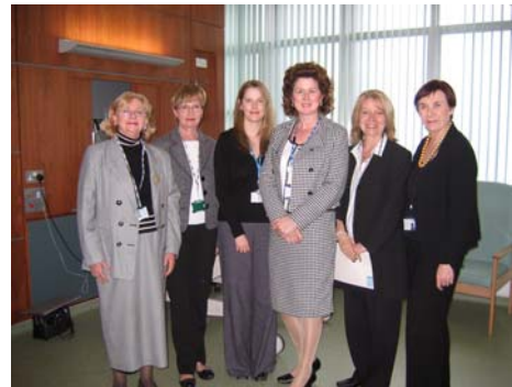
Scrutiny councillors and North West London Health Trust colleagues in one of the new maternity suites at Northwick Park Hospital

In March, a number of us visited Northwick Park Hospital to look around the facilities and speak with staff about care issues and the recent improvements at the hospital. We met with the Chief Executive and the Head of Midwifery and were shown around the newly refurbished maternity facilities, as well as the children's wards and Accident and Emergency department. Over the past year, the sub-committee has discussed at length the actions taken by North West London Hospitals Trust to address the Healthcare Commission investigation into maternal deaths at Northwick Park Hospital. It was valuable to witness directly the improved practices at the Hospital and hear first hand from those involved in providing care to patients. The sub-committee is assured that lessons have been learnt and clinical care is improving as a consequence.