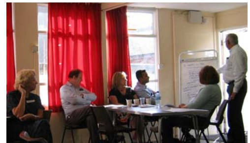
Scrutiny councillors consider their role