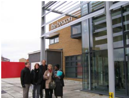
Visiting 'the beacon', Rayners Lane

Arts Culture Harrow challenge panel – following the collapse of the council's partner in the delivery of arts services for the borough, a challenge panel was held to investigate the reasons for the financial difficulties so that future arts provision does not make the same mistakes as seem to have been the case with Arts Culture Harrow.