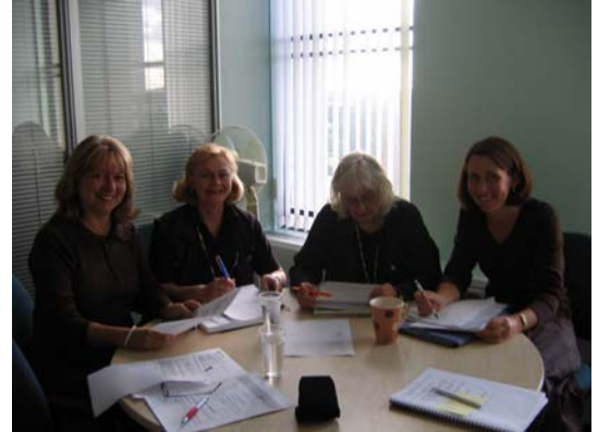
Members of the Standing review of NHS Finances

These pilots have been used to investigate a number of topics and the reports from each of the scrutiny committees discuss a specific example. All-in-all, the new ways of working seem to be offering a very useful additional string to scrutiny's bow, our evaluation suggests an overall high level of satisfaction with those projects that have taken place so far.