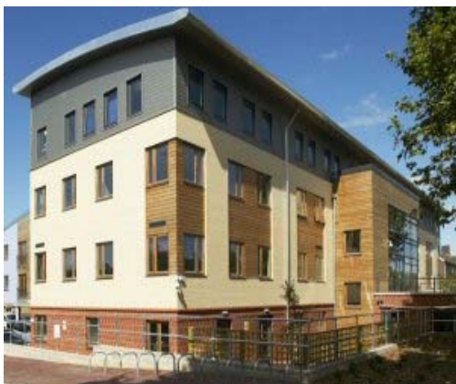
The new Health and Social Care Centre in Alexandra Avenue, Rayners Lane

This year in seeking to improve how scrutiny is conducted in Harrow, scrutiny has piloted a number of new methodologies in its review work. Two of these have been applied to health and social care matters. Reflecting the picture around much of London, and indeed nationally, NHS partners find themselves encountering challenging financial times. A standing review to consider local NHS financial positions has been set up and this is detailed in more depth under the Overview and Scrutiny Committee's section of this annual report. In November, the Adult Health and Social Care Sub-Committee conducted a Challenge Panel to examine issues relating to homecare and this is detailed below in the case study.